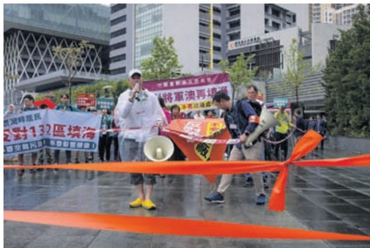
Protesters wearing number tags during a rally in Hong Kong, Sunday, March 26, 2023. Dozens of people on Sunday joined Hong Kong's first authorized demonstration against the government since the lifting of major COVID-19 restrictions under unprecedentedly strict rules, including wearing a numbered badge around their necks.